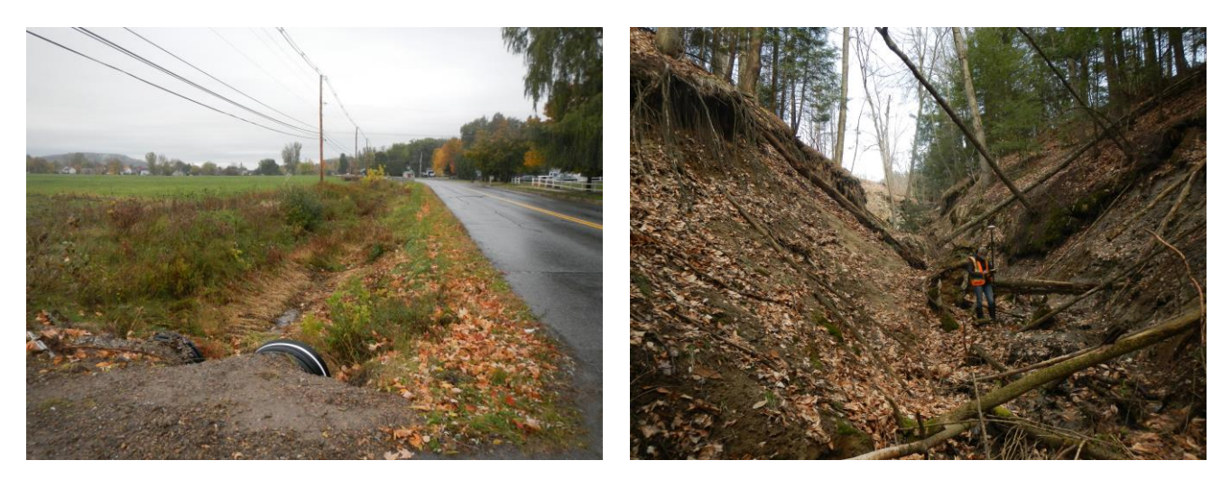
Figure 2: Two sites had the highest score (36 out of 50). Project O-1 (left) is located along North Rd where a large agricultural drainage flows to a roadside ditch with areas of erosion. The size of the drainage area and erosion along flowpaths into the ditch yield the highest estimated phosphorus load of all projects. Project SS-1 (right) is located on Stacy Street where a roadway drainage network is piped to a very large and active gully.