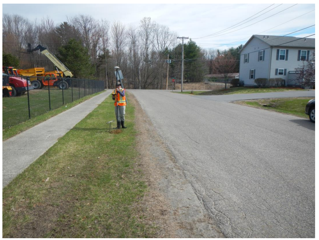
Figure 3: FEA staff collecting survey data and soils data for a grassed swale BMP along Nancy Drive (Project RT7-16)

projects would have the greatest benefit to the upcoming Town PCP efforts. Thirteen (13) projects were selected at this meeting for concept designs, and a short-list of additional projects were selected for further investigation. Two additional projects were identified in the spring of 2019 by FEA and the Milton Town Highway Department and were selected for concept designs. FEA completed 6 site visits to collect survey data, map drainage infrastructure, collect preliminary soil information for BMP considerations, and improve BMP designs and cost estimates for the 15 projects selected for concept design (Figure 3). Descriptions for the stormwater problem areas selected for concept designs are provided in Table 9 below.